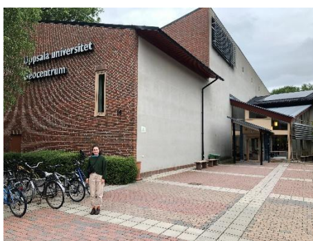
Photo outside of the Geocentrum Building, Uppsala University.

Without the support of the Ad Astra Academy, I would not have been able to undertake this experience. The provision of financial security to complete voluntary research work is something that I was hugely fortunate to receive, and something that I am truly grateful to the Academy for. While in Sweden, I not only got the chance to gain real-life practical experience in the life of a researcher, I also got to broaden my horizons by making connections with other faculty staff and students who work within the realm of sustainability.