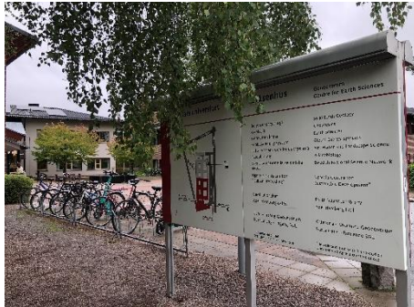
Department of Earth Sciences, Uppsala University, Sweden.

Link to a blog post about my work with LANDPATHS: News - LANDPATHS (uu.se)